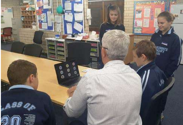
Our School Captains beamed our first virtual assembly from the Staffroom.